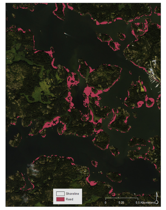
Fig. 2. Common reed extent in Tammisaari archipelago, SW Finland in July 2013 based on NDVI index with a threshold value of 0.2.

Reed extent in Tammisaari archipelago, SW Finland in July 2013 based on NDVI index with a treshold value of 0.2