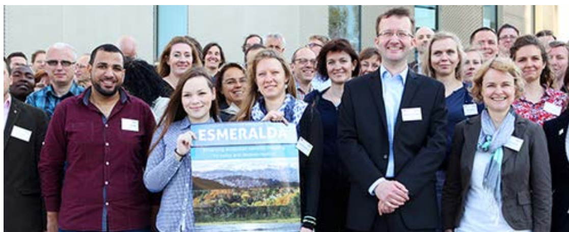
Esmeralda group photo.