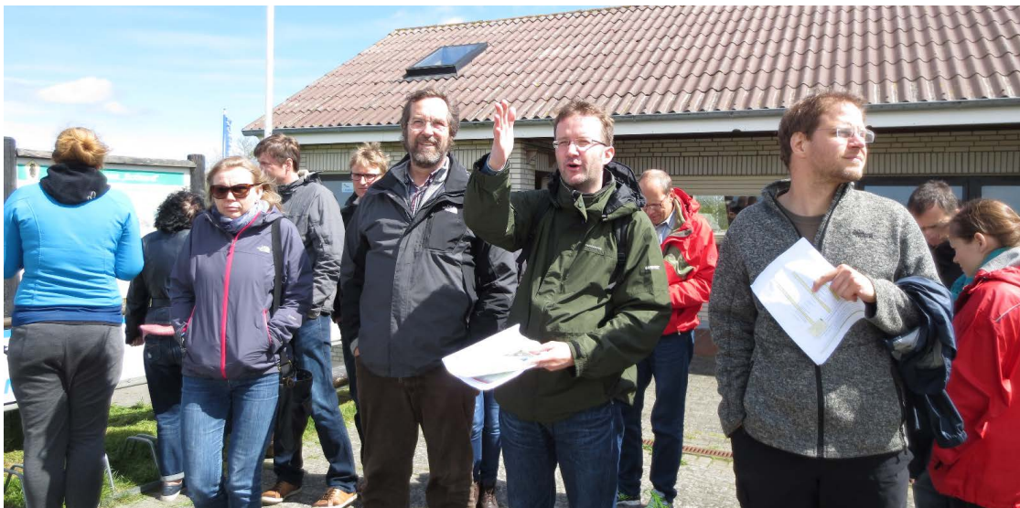
EMSERALDA Excursion.

The EU H2020 funded ESMERALDA project kick-off meeting took place between 5 - 7 May 2015 at the University of Kiel, Germany.